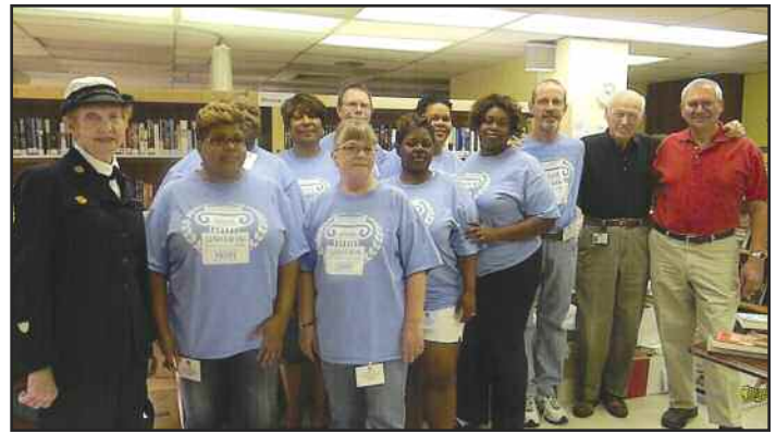
Veteran volunteers pictured with Kemper employees.