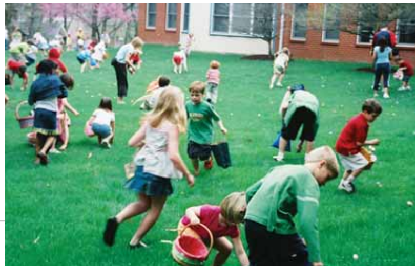
Children scramble in search of eggs at the annual Easter egg hunt at Bethesda Orchard.

staff committed to top-tier care, Bethesda residents enjoy living in apartment and patio home communities throughout the St. Louis area. Whether they choose to venture into attached gardens or travel into the countryside for a view of fall foliage, seniors live as they choose in Bethesda Health Group residences.